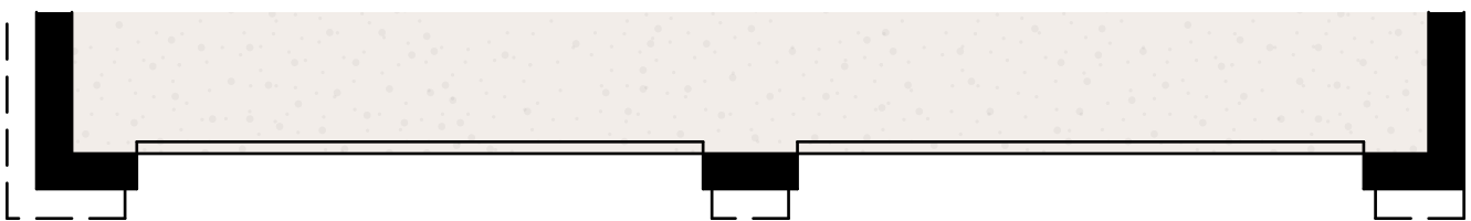
Opt Double Garage Door